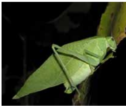
Greater Angle-wing Katydid

than it is with any other organism. Please join us for a rare look at some of Colorado's most watchable "bugs," and an entertaining explanation.