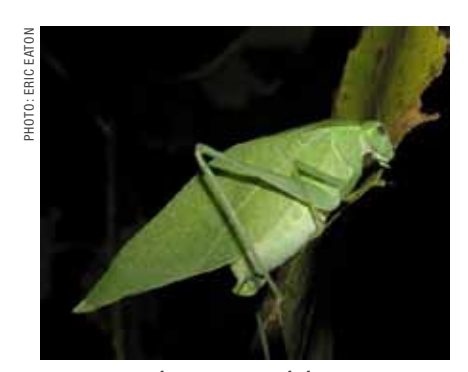
Greater Angle-wing Katydid

INSECTS ARE WILDLIFE. TOO! WE MAY CONSIDER MOST insects to be garden-eating, garbage-infesting, blood-sucking pests, but the truth is the overwhelming majority are vital to our lives, and the cornerstones of healthy habitats.