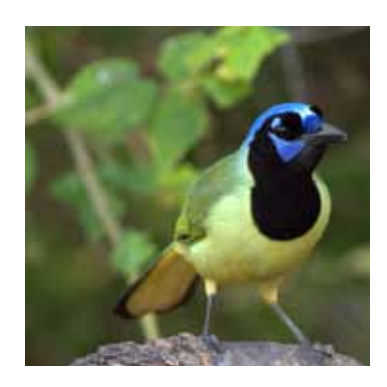
Green Jay

AKE A BREAK FROM YOUR THANKSGIVING baking and take a virtual field trip to the Lower Rio Grande Valley and the Rio Grande Valley Birding Festival.