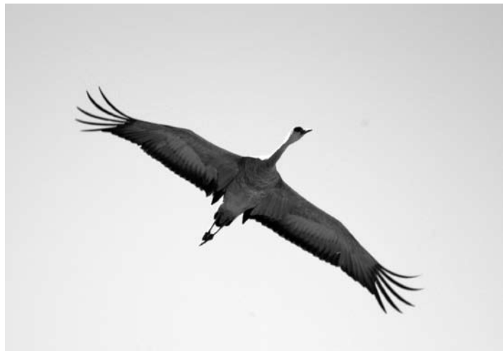
Sandhill Crane, heading for the hills.