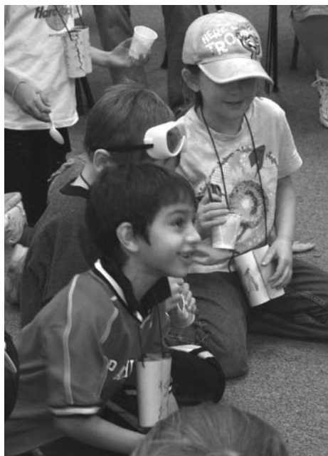
Making binos (above) and Great Blue Herons.

Aiken Audubon Society 6660 Delmonico Dr. D-195, Colorado Springs, CO 80919