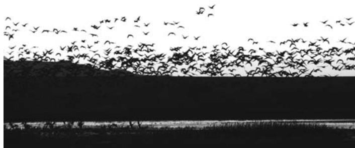
Snow Geese flight at dawn, Bosque del Apache.

More information: www.friendsofthebosque.org www.fws.gov/southwest/refuges/newmex/bosque Festival Registrar: Kit Owens, registrar@sdco.org or 505-835-2077